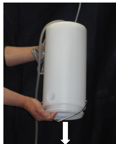
Fig.2 Wrong drainage

(Put Temperature control parts and Round thermometer upward.)