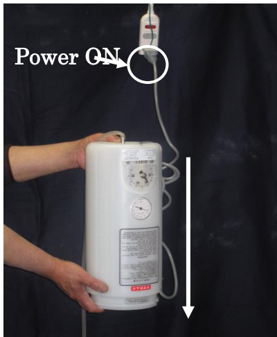
Drawing 1 (The container upside leaving power on)